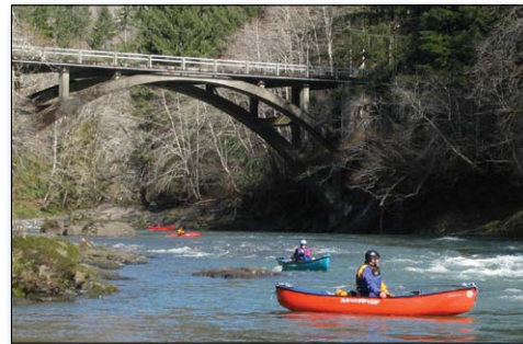
Figure 1. Oregon's Wilson River is popular site for kayakers and canoeists.

The Tillamook Bay National Estuary Program, now known as the Tillamook Estuaries Partnership (TEP), worked closely with community, state and federal entities to develop and implement the Tillamook Bay Comprehensive Conservation and Management Plan beginning in 1999. The plan recommended 63 actions that could help improve water quality, enhance aquatic habitat and mitigate flooding.