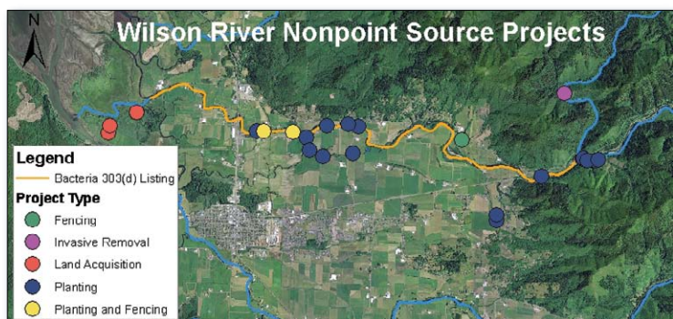
Figure 2. Stakeholders completed numerous restoration projects in the lower Wilson River watershed.

Between 2002 and 2007 stakeholders implemented numerous BMPs in the lower Wilson River watershed (Figure 2). The TBWC, TEP and Tillamook SWCD worked with landowners to complete 20 riparian enhancement projects (12 of which were BYPP projects) that included planting, fencing and invasive species removal. The projects stabilized streambanks and removed livestock from the river's riparian area. In addition, TEP acquired three sensitive wetland parcels, which will be restored in the coming years and maintained by Tillamook County as permanent wetland areas.